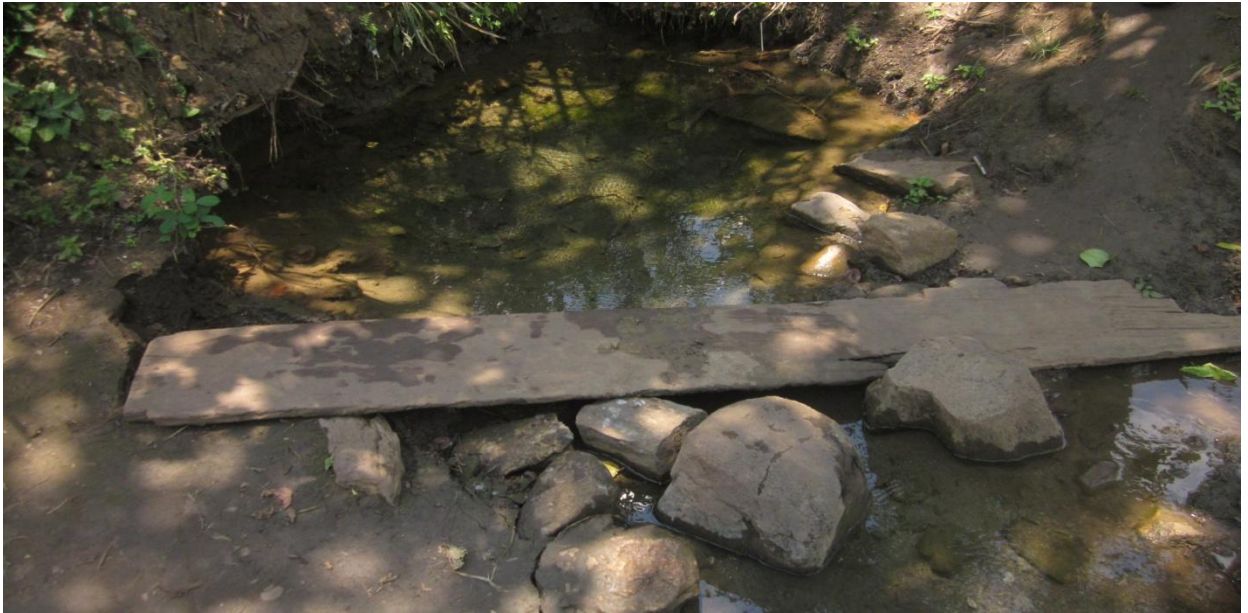
6: Dug/Ring Wells drilling